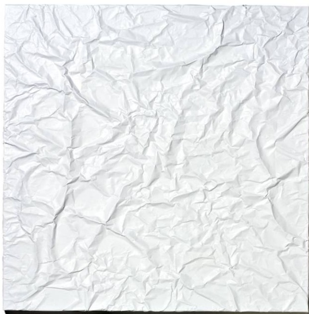
September 15 White, 2008, Acrylic on paper on canvas, 48" x 48"

flatten them and then carefully repair them and fix them to canvas. The abstract patterns, the webs and ridges of the paper, can look like many things in nature. But mostly,