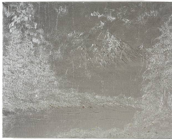
Silver Landscape, 2009, aluminum leaf on oil, 16" x 20"

These paintings are made by walking in a circle. The circle is comprised of lots of footprints (Vans sneaker treads). The canvas records all of my movements and weight. To make the painting, I must be completely in it. Each point of the circle looks like it is forming and falling apart. I like the connection to practices such as kinhin and circumambulation, as well as to the studio practice of pacing. There is a universal quality to just walking in circles. We leave the house in the morning, we return in the evening. We're always walking in circles. Where's the progress? We're always returning.